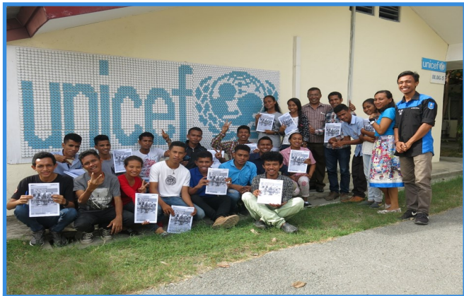
Alumni of Youth Parliament Members and UNICEF

On the 5th to the 9th of June 2017, the Secretary of State for youth and Sports (SSYS) conducted a Life Skills Based Education (LSBE) Training of Trainers (TOT) for Alumni of Youth Parliament and UNICEF Innovation Hub Members in collaboration with UNICEF.