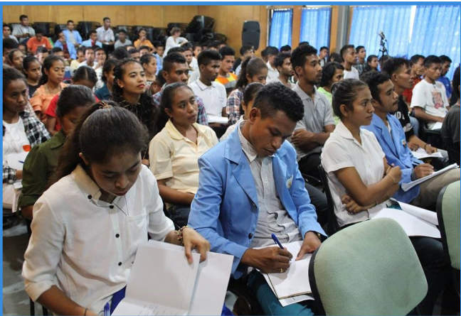
Students from the UNTL taking notes during the Demographic Dividend lecture