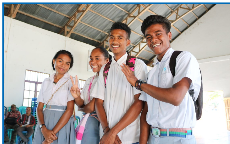
Youth in Oecusse engaging in the Agribusiness

The Youth center therefore aims to develop Agri-business across the region by empowering, connecting and employing young men and women through entrepreneurial support, incubation, prototyping, skills development and professional mentorship.